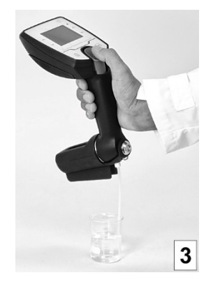
Fig. 7: Filling sample with the filling tube

TIP: If the movement of the pump lever feels stiff, start by filling deionized water in order to reduce the friction. Then empty the filling tube and fill your sample.