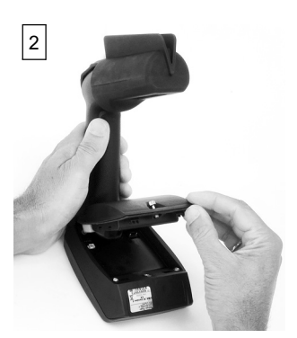
Fig. 12: Removing the battery compartment