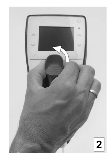
Fig. 9: Dismounting the pump