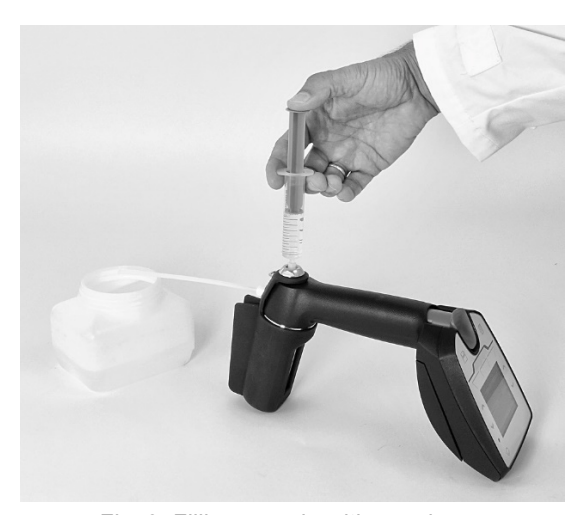
Fig. 8: Filling sample with a syringe