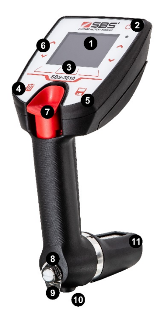
Fig. 1: Views of the instrument